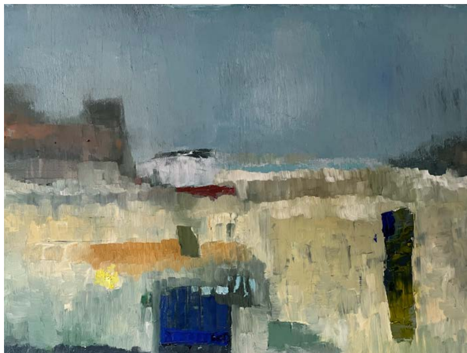
Saint Andrews Oil on Canvas