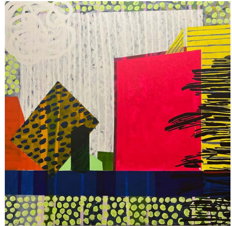
Kings Podium Mixed Media