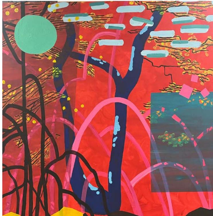
Kew Treehouse Mixed Media