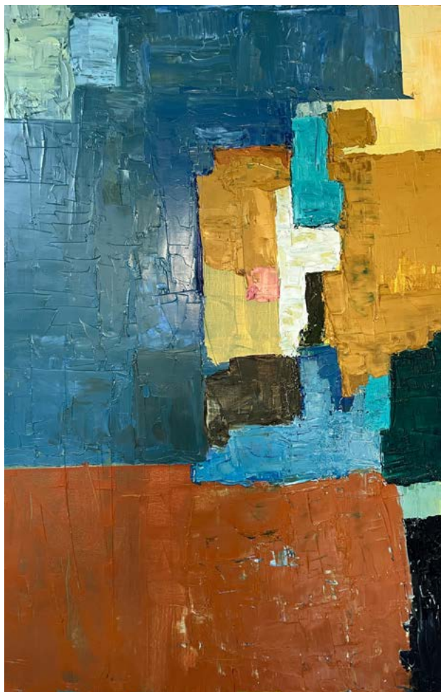
Blue to Centre Oil on Canvas