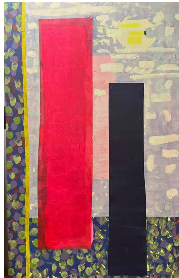
Notts Wall Mixed Media