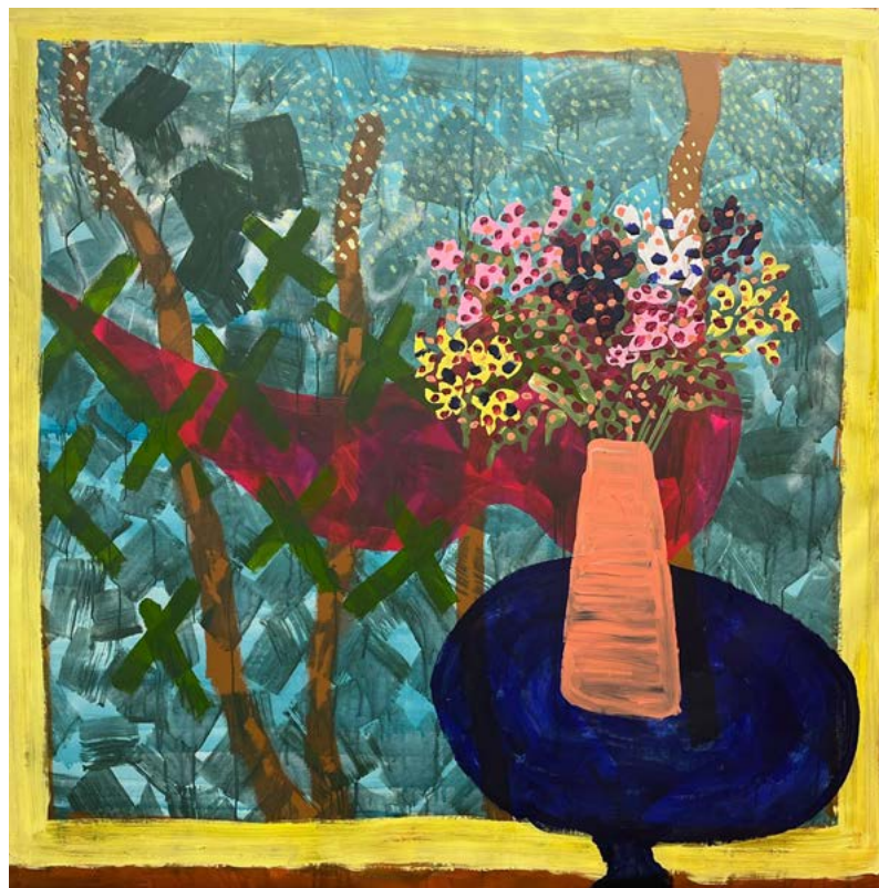
Debden Flowers Mixed Media